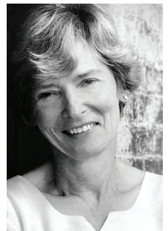
Author Lou Mandler

mhs.mt.gov/pubs/books/#MontanasVisionaryMayor